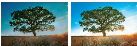
No HDR With HDR * For illustration purpose only