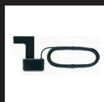
CA-AN- DAB.001 DAB/DAB+ Digital Radio Antenna