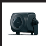
ND-BC8 Reverse Camera