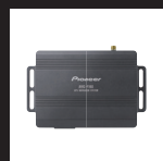
AVIC-F160-2 (1) Navigation system for campers and lorries