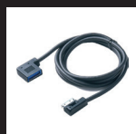
CD-RGB150E 1.5m Extension Cable