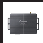
AVIC-F260-2 (1) Navigation system